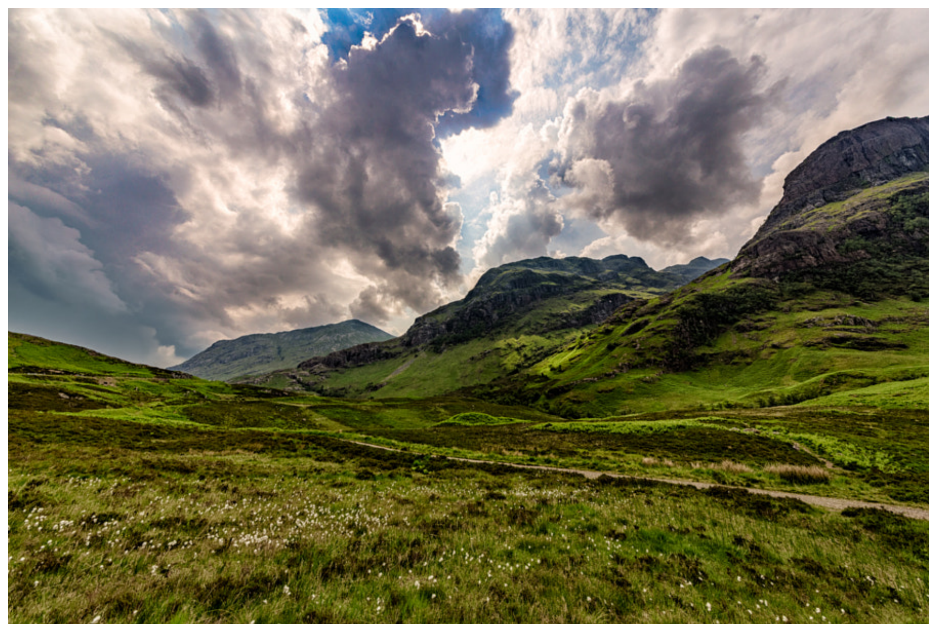
The Three Sisters (Glencoe)