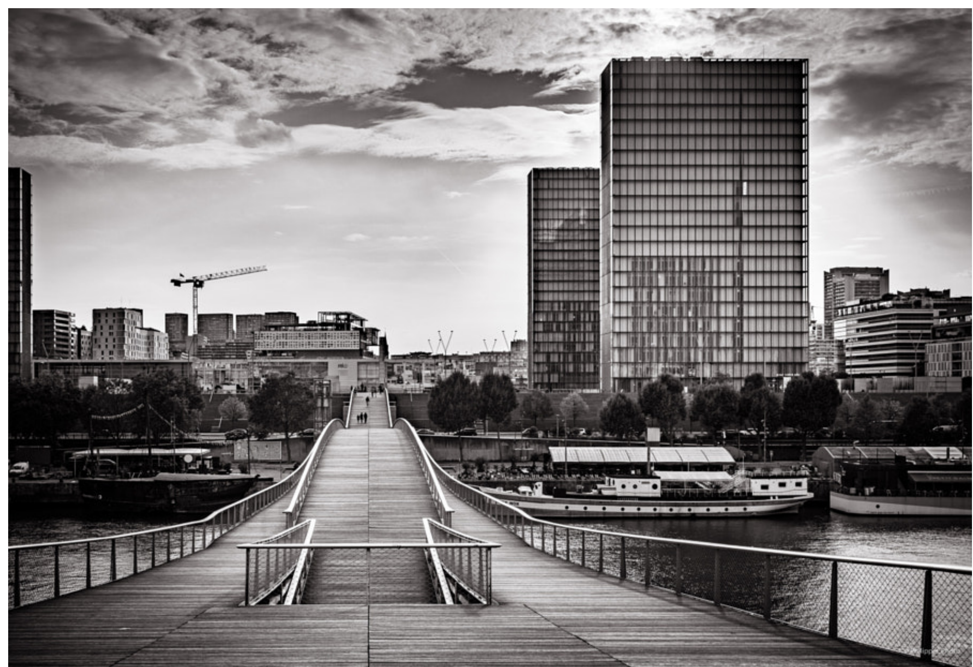
BNF (Paris Bercy) – Library François Mitterrand