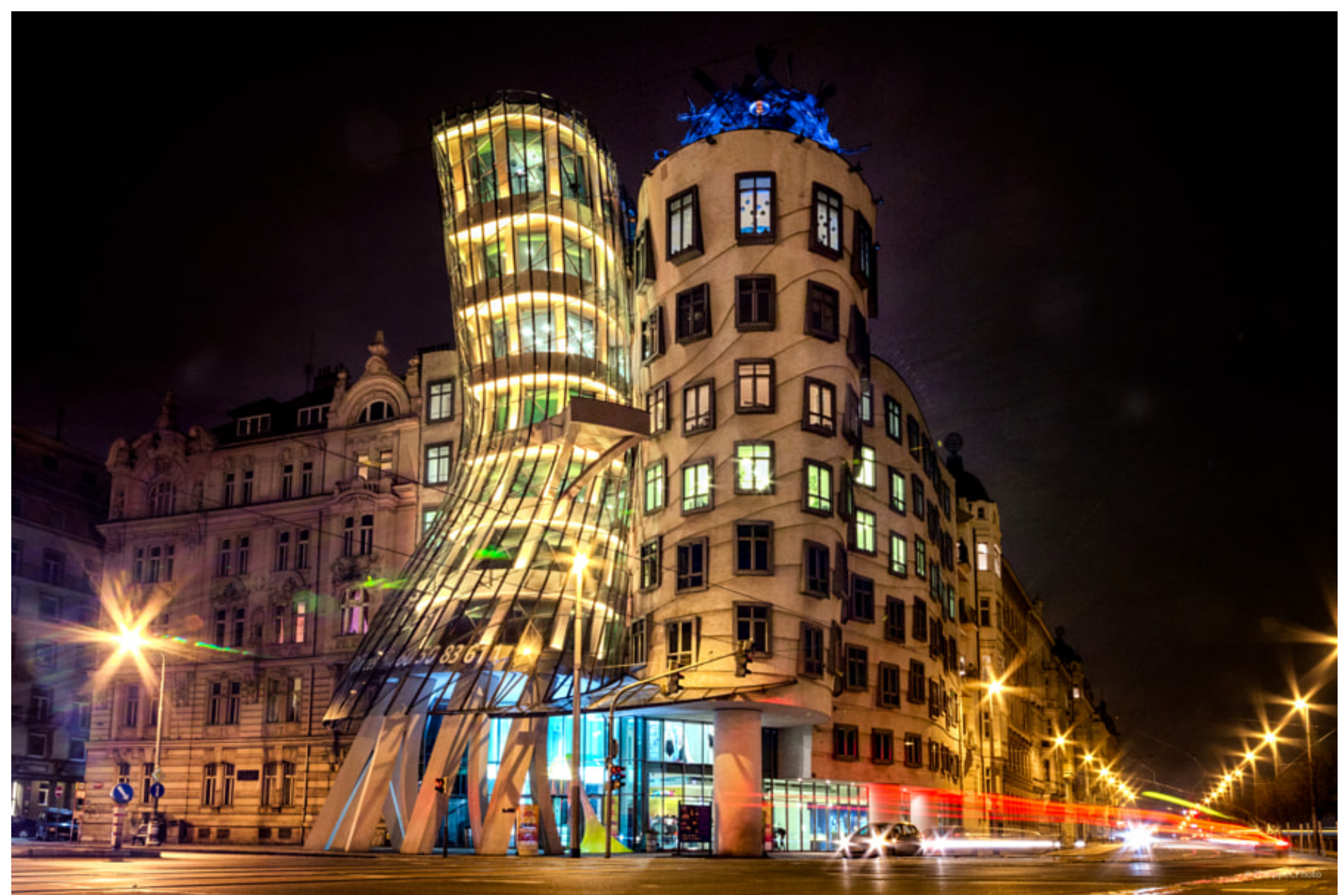
“Fred & Ginger” The Dancing House (Prague)