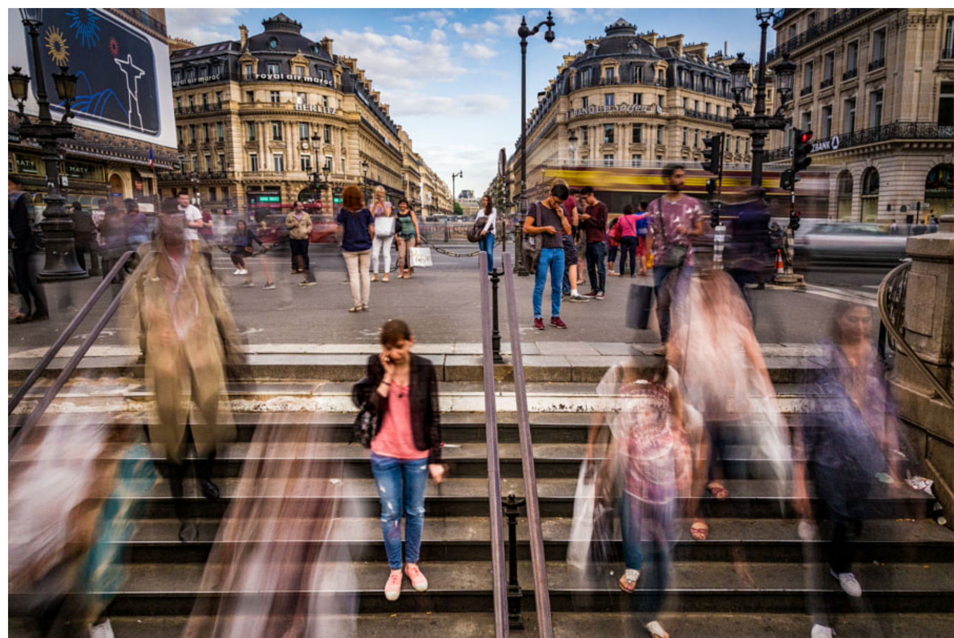
Moving People (Paris)